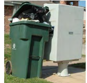
Don't set out close to mailboxes.