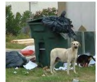
No extra trash in the sides.