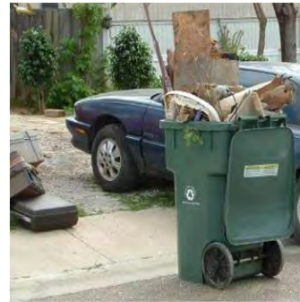
Don't set out close to vehicles and bin with the wheels facing the home.